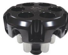
P32ST Swinging Bucket Rotor