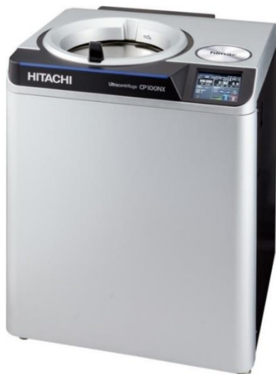
Ultracentrifuge Model CP100NX